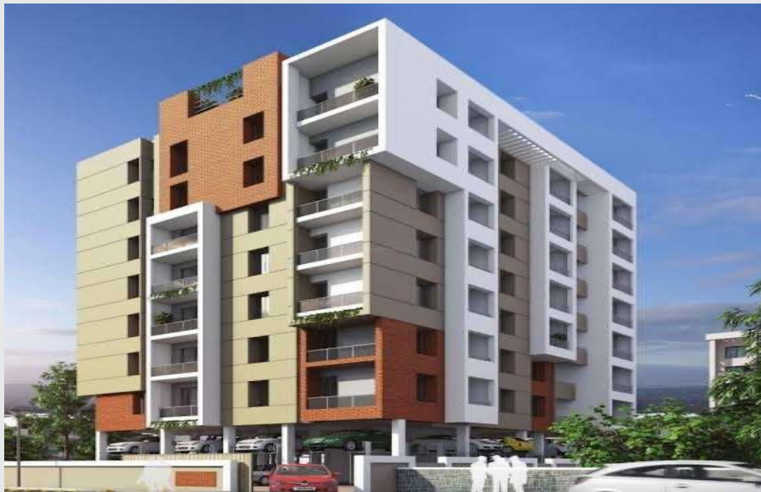
Project : Gokhale Agam, Kothrud Pune