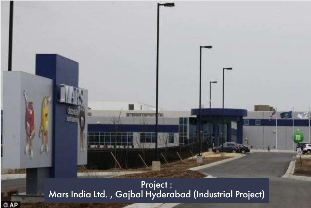
Project : Mars India Ltd. , Gajbal Hyderabad (Industrial Project)