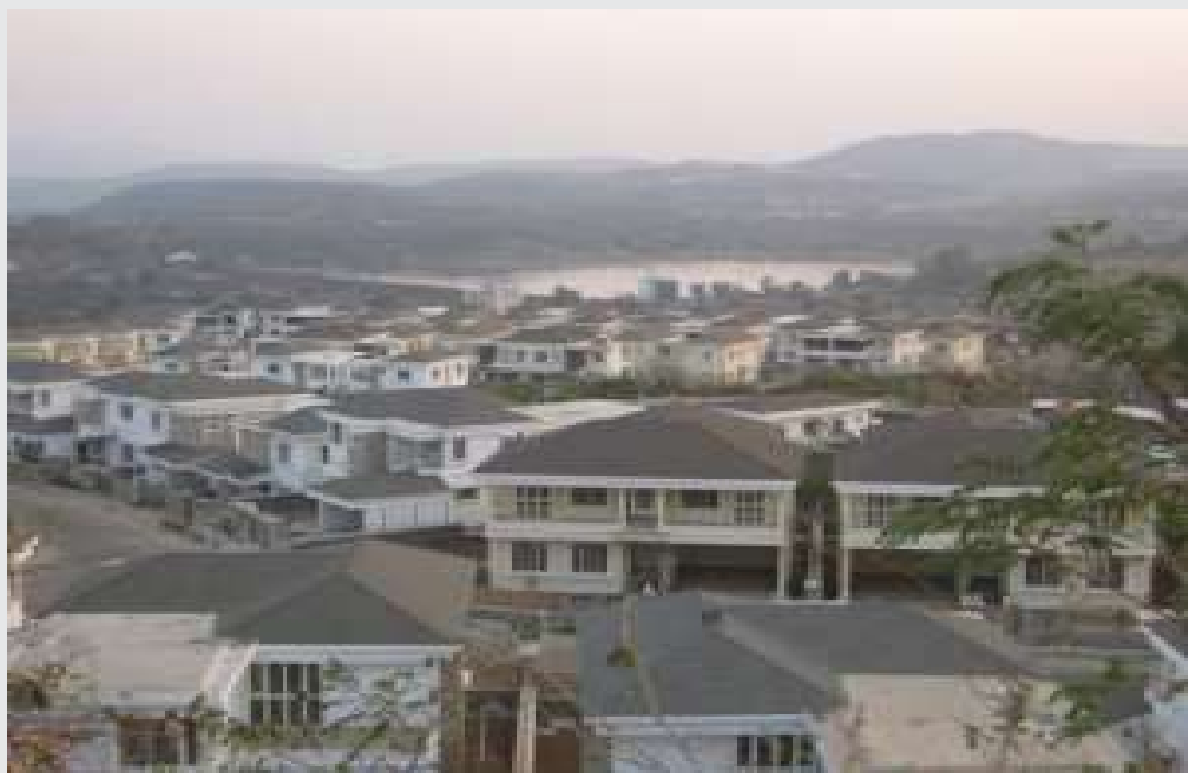
Project : Forest Trails by Paranjape, Bhugaon Pune (Bungalow & Residential Building)