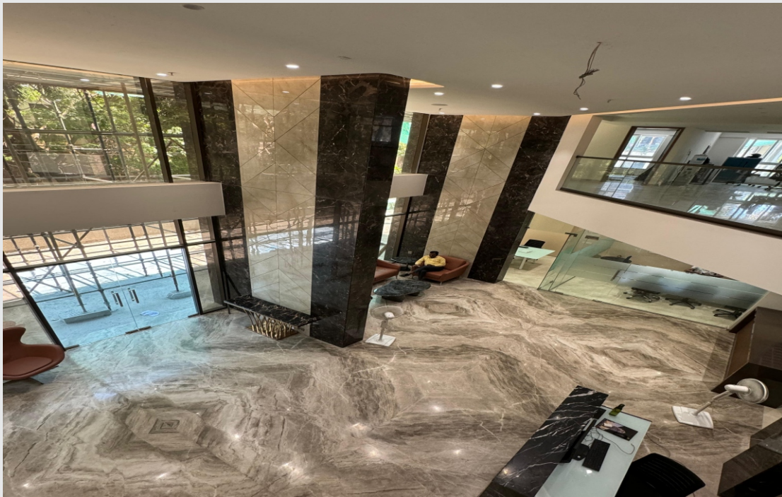
Project: Ekka Elitas - Kothrud, Pune