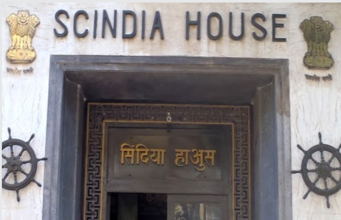
Project: SCINDIA House - CST, Mumbai