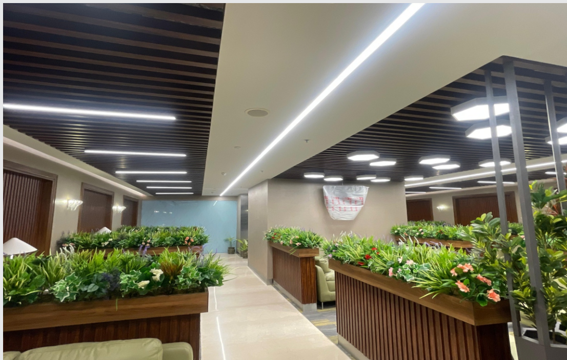
Project: Pune International Airport