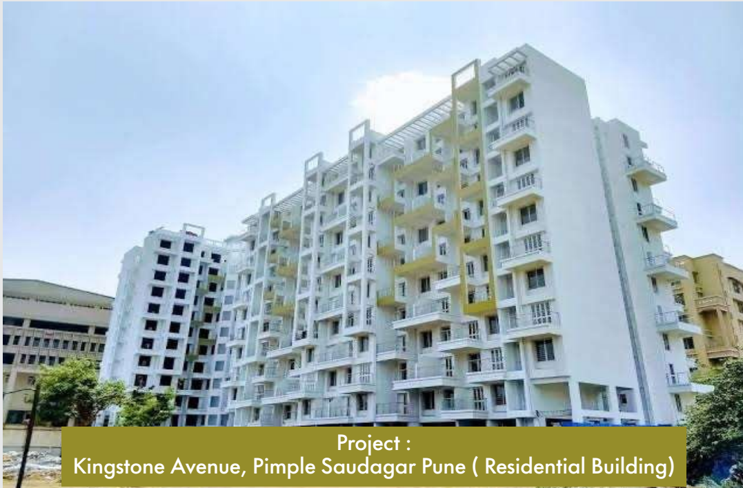
Project : Kingstone Avenue, Pimple Saudagar Pune ( Residential Building)