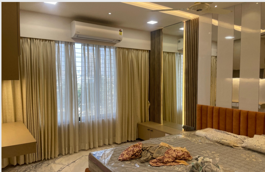
Project: Royal Tusk - Dadar, Mumbai