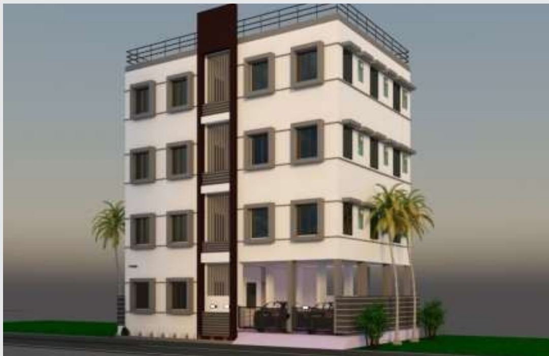
Project : Babosa Villa, Wakad Pune