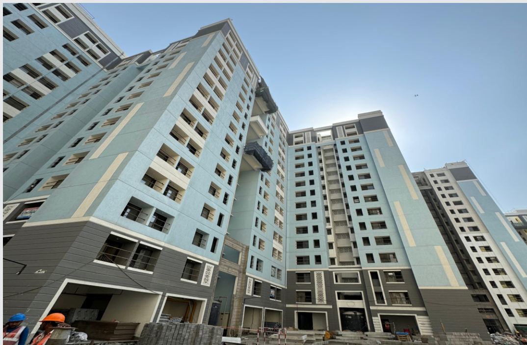
Project by- L&T Cidco Housing Society - Ulwe, Navi Mumbai