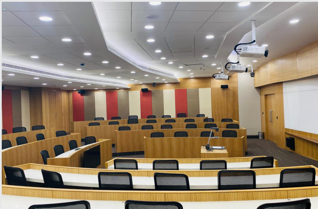
Project : Shailesh J. Mehta School of Institute, IIT Bombay.