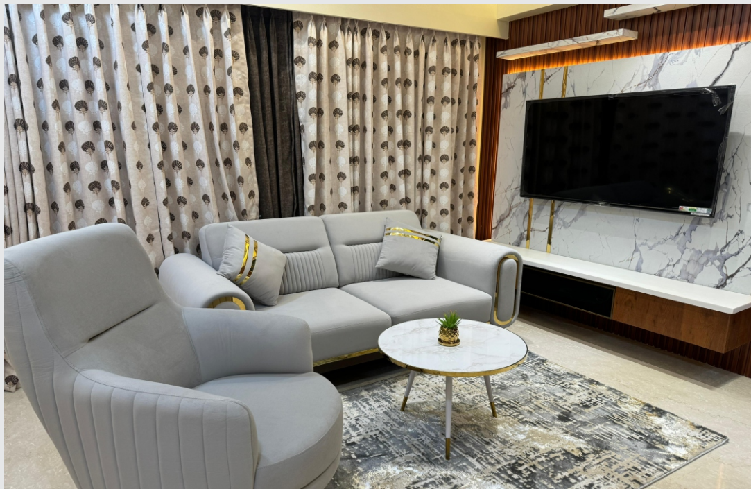
Project: Lodha Palava - Mumbai