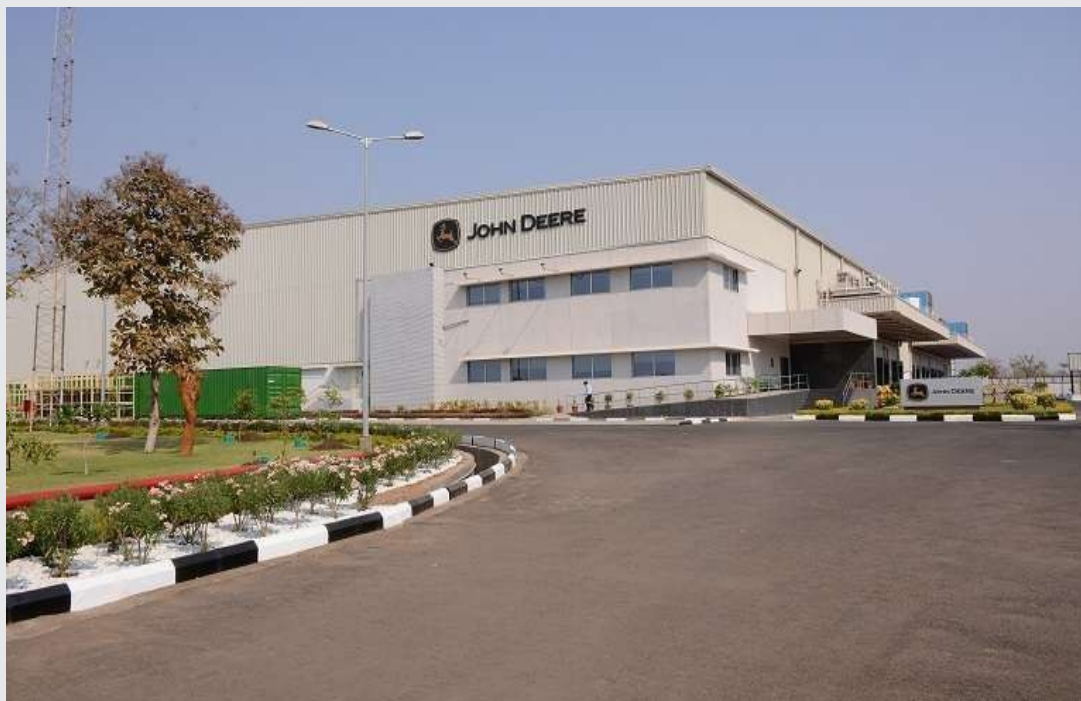
Project : John Deere, Dewas M.P. (Industrial Project)