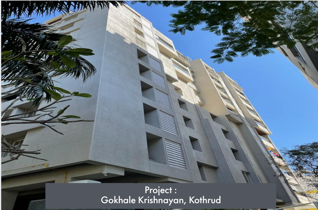
Project : Gokhale Krishnayan, Kothrud