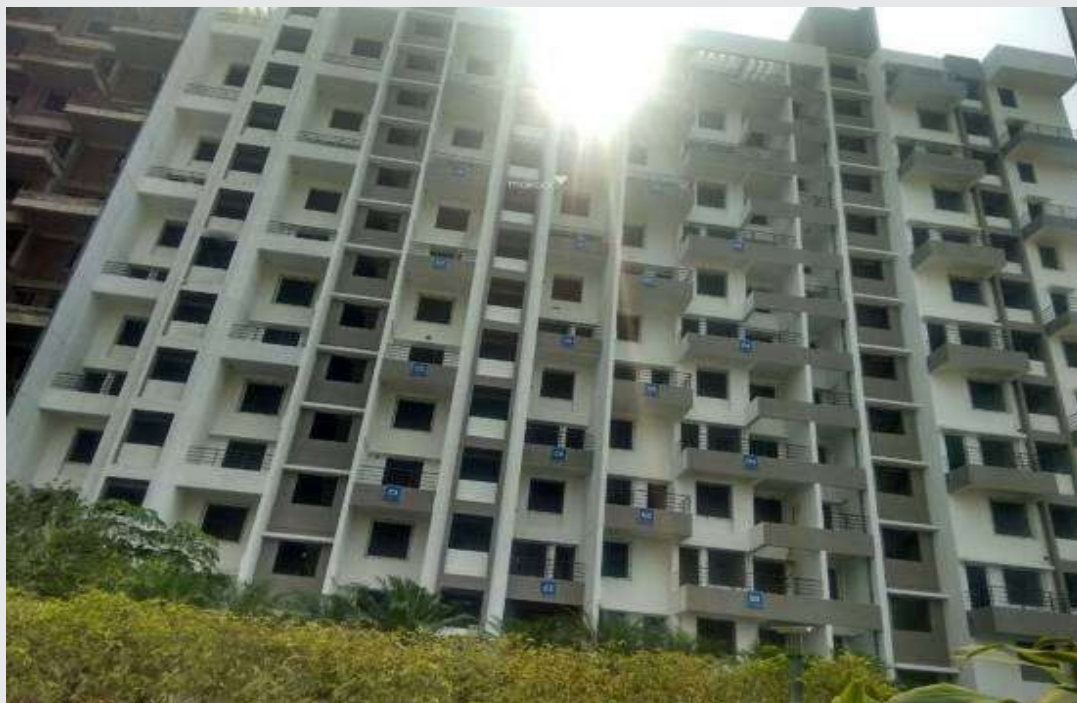
Project : Briz by Gokhale , Pirangute Pune ( Residential Building)