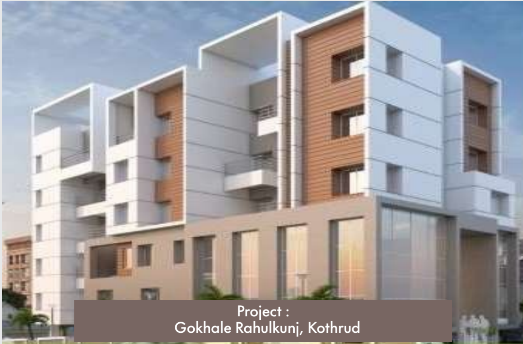
Project : Gokhale Rahulkunj, Kothrud