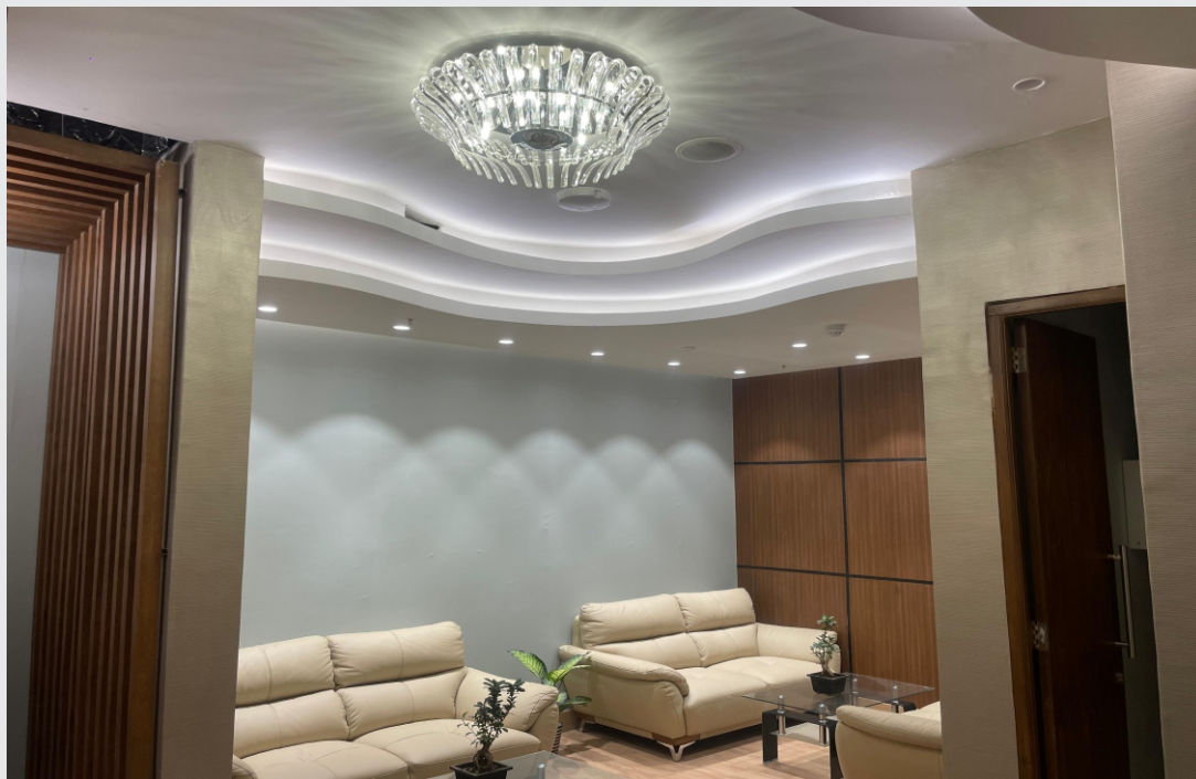
Project: Pune International Airport